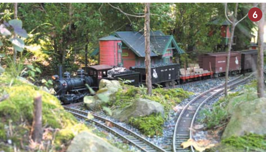
A mixed freight leaves the water tower at Woodland Junction, preparing for the long steep grade up to Hemlock Hills. If the consist is over six or seven cars, a helper engine must be called out.

The side-yard addition, like the woods line, consists of a mainline between two reverse loops. Two yards were added, allowing us to carry freight between four towns. In the woods we named the towns Tall Oaks, for the trees surrounding one of the reverse loops; and Hemlock Hills, because of several hemlocks planted in the other. In the side yard, the town at the edge of the woods was called Woodland