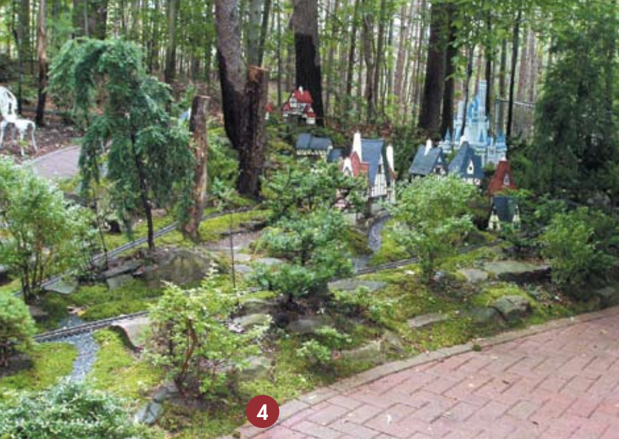
ABOVE: The European flavor of Hemlock Hills comes through in this overview of the area. Native moss fills nearly every empty space.