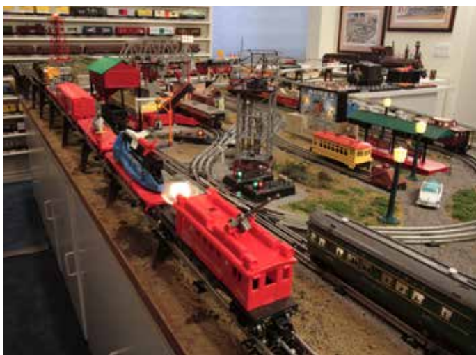
TRADITIONAL TOY-LIKE IN O GAUGE Steve Garofalo's O gauge layout (December 2008 CTT) flies the flag of a traditional toy train layout. Decoration is minimal and evokes the layouts of the 1950s and '60s.