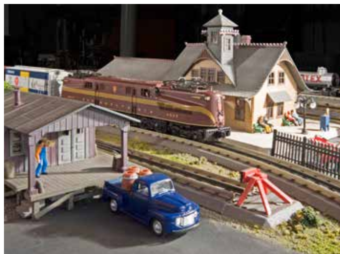
TOY-RAIL IN O GAUGE Rich Turello's O gauge layout (July 2008 CTT) shows decoration and additional detail, but the placement of the MTH RealTrax on the tabletop will still classify this as a toy-rail layout.