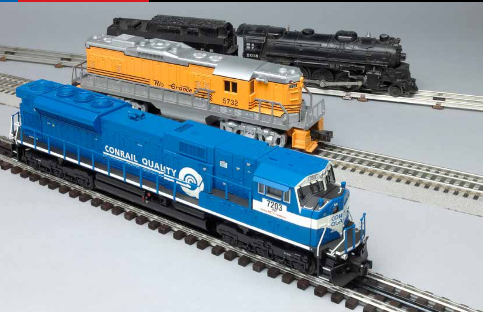
▲ Consider your space, your trains, and the overall look you want to achieve before committing to a track brand. Rear to front are traditional postwar-style O gauge tubular track by Lionel and a postwar no. 2018 2-6-4. In the center is a Williams GP9 riding on Lionel FasTrack, and in front a Lionel LionMaster diesel poses on GarGraves flextrack.