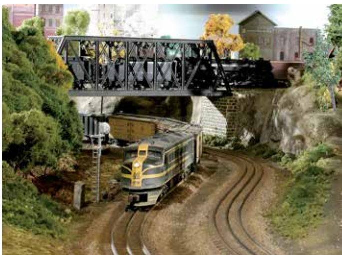
HI-RAIL IN O GAUGE Extensive scenery and integration of the GarGraves track with a meticulous roadbed mark Dave Connolly's O gauge layout (March 2008 CTT) as a hi-rail layout. Trains, track and structures are in harmony.