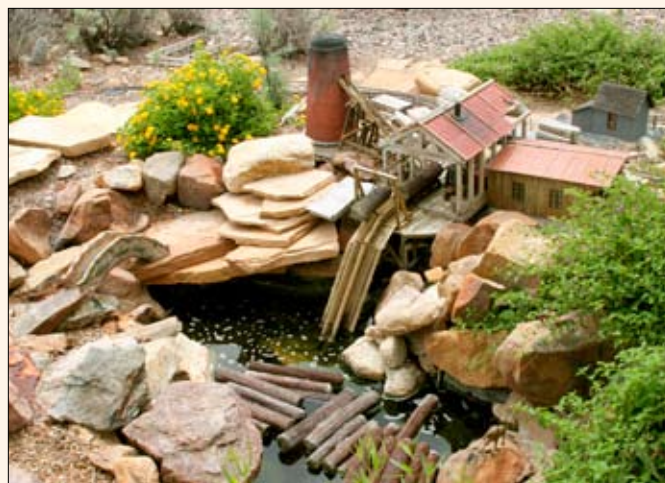
8. The sawmill and bark burner with their attendant log pond. Two shrubby groundcovers soften this industry: lantana, with yellow blooms, and autumn sage, with dark pink flowers.

visitor can only see a small portion of this loop at any given point.