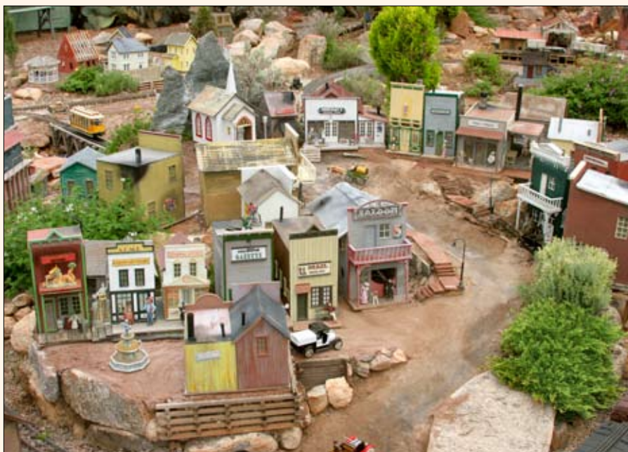
9. The town of Eagle Mountain is well populated and bustling. Structures are a combination of kit-built, kitbashed, and scratchbuilt. Plausible and thoughtful placement makes this scene come alive.

As we walk further along, there is some track construction and a complete work camp with tents for housing and feeding the gandy dancers. Laborers are largely