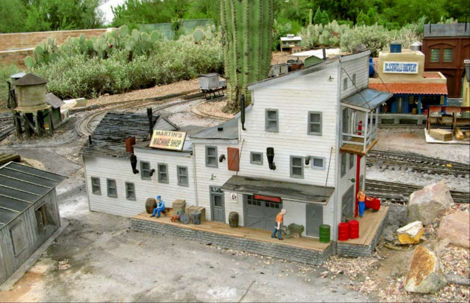
2. Martin's Machine Shop is typical of the industrial buildings on the Eagle Mountain Railroad. Meticulous attention to detail gives the scene veracity. The giant saguaro base makes the prickly pear border seem farther away.