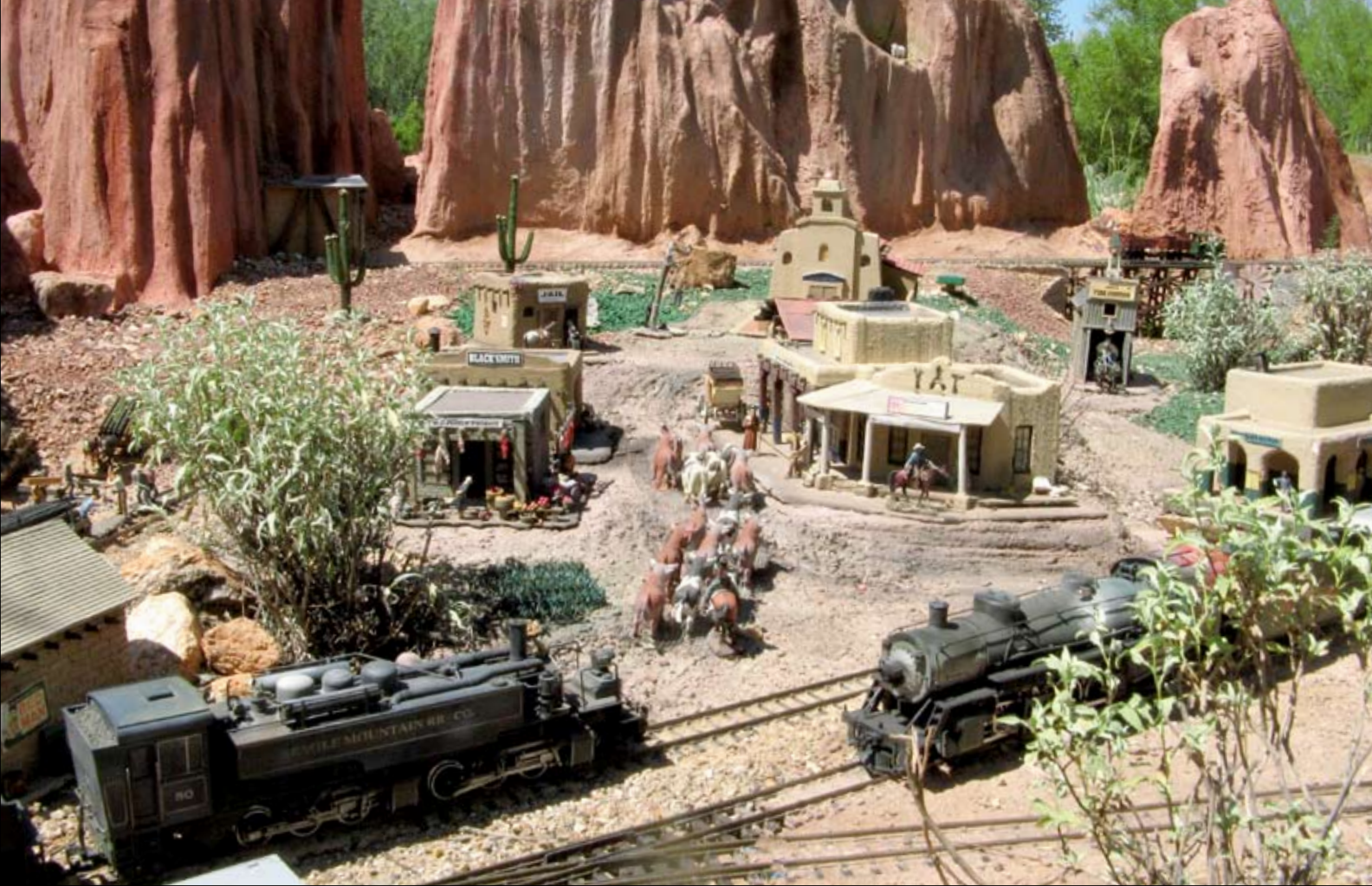
3. The adobe town of Old Nogales resides on the backside of the Eagle Mountains. A cattle drive is taking place up the main street. Sage-colored brittlebushes will be aflame with golden "daisies" in the spring.

and many buildings are supported by pilings or timber cribbing. The architecture is eclectic, most buildings being of wood, with a few of brick. A busy blacksmith's shop, complete with flickering fire, is located on one side of the town.