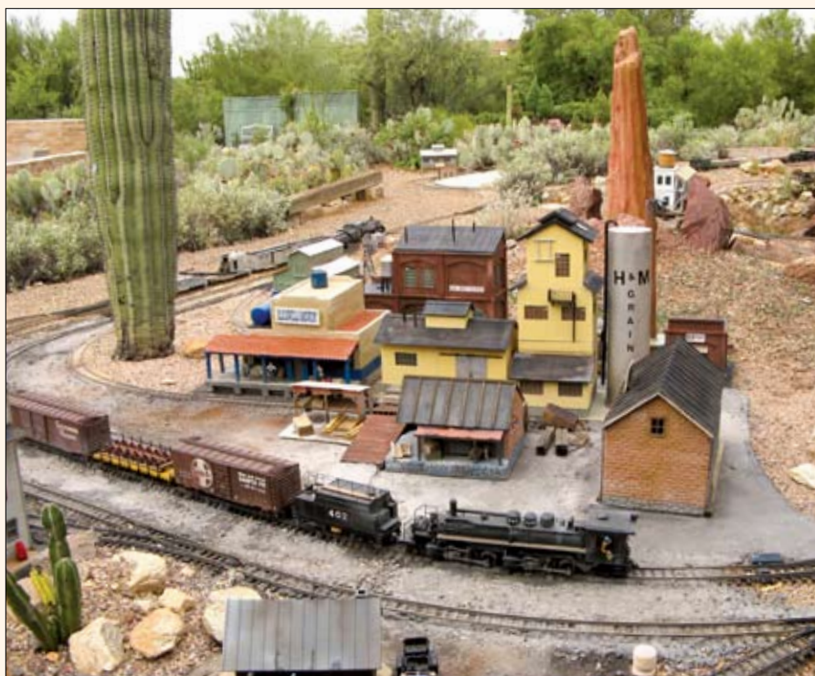
4. The Yuma industrial area features a variety of businesses served by railroad spurs. A 2-6-6-2 cab forward takes its train past the brewery and the grain company. The base of a saguaro cactus towers over the grain depot.

On the far side of the streetcar line the terrain is more level. It is in this area that the mansion of the mine owner, as well as other upscale housing, is located. There is