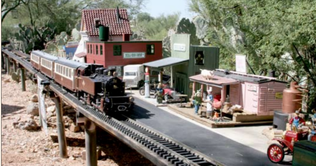
6. This elevated section of line facilitates the loading and unloading of visiting trains. All of the structures and vignettes on this section depict scenes along old Route 66. A canopy of mesquite, palo verde and Aleppo pine provide shade.

Branching from the first loop is a line through a tunnel, past a sand quarry, and on up to the third loop. At this point you are behind the Martins' house and the ground has leveled out. It doesn't appear level, however, because Gary has built a six-foot-tall range of mountains that reflect both the reddish color and stark shapes of Spider Rock in Canyon de Chelly, the mesas of Monument Valley, and the rugged Superstition Mountains. The Eagle Mountain's third loop circles this mountain range but the massive size of the artificial mountains ensures that the