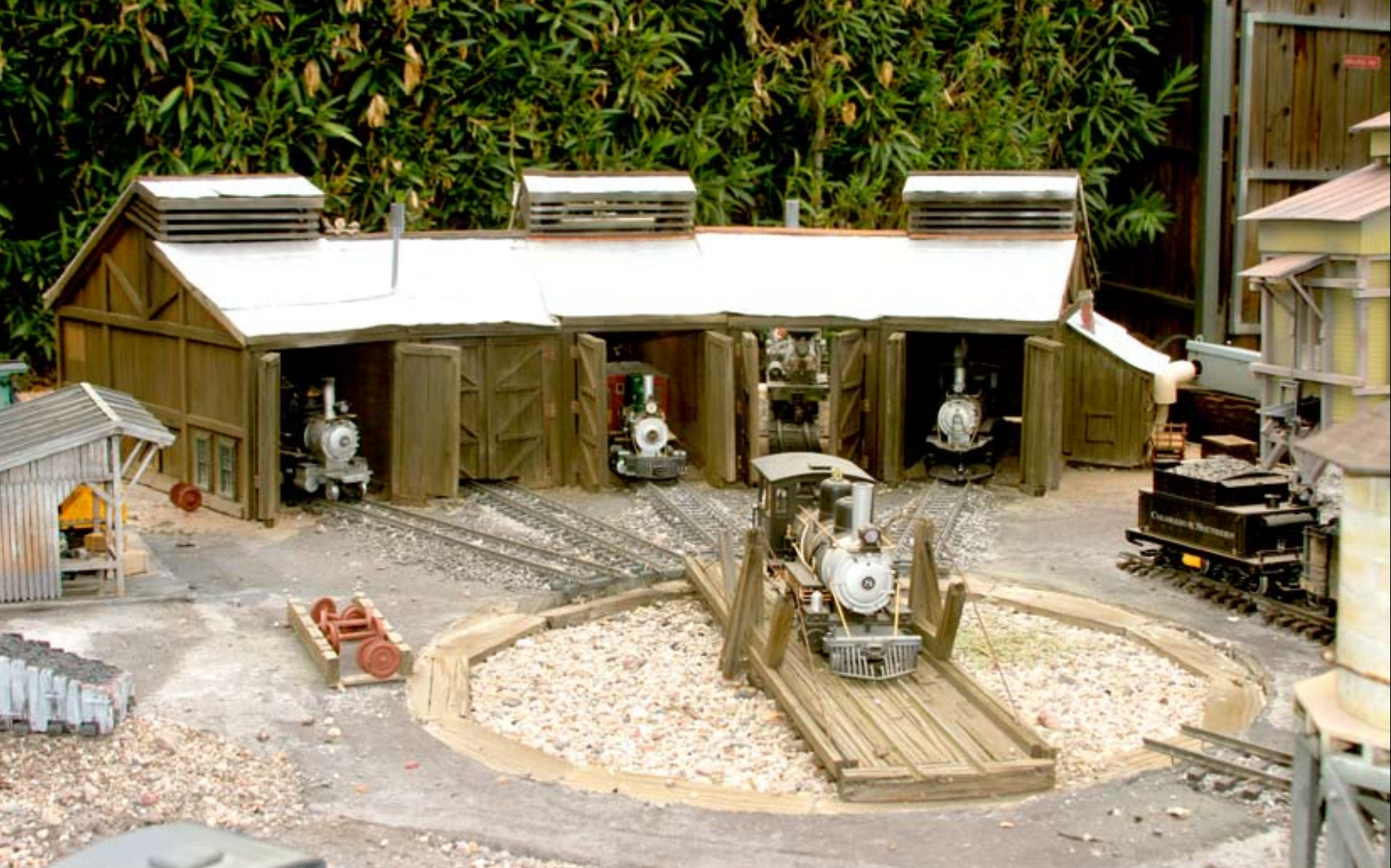
5. The five-stall enginehouse at the Eagle Mountain Railroad's primary engine facility. On the far right is the coal trolley.