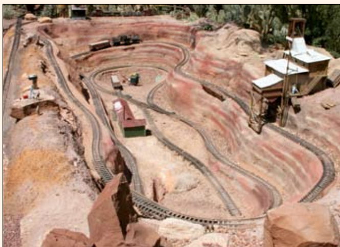
7. The Emerald Mining Company's open-pit copper mine is one of the more spectacular features of this railroad. The Shay descends four feet into the ground to collect its single car of ore.