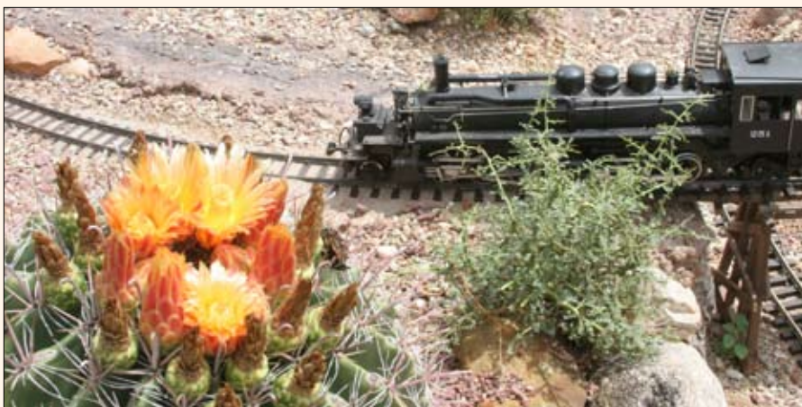
One of the railroad's articulated locomotives crosses a short trestle. Sunny flowers emerge from a fishhook barrel cactus.